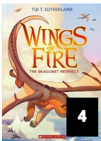
Dragonet Prophecy #1 The Wings of Fire Anh Do