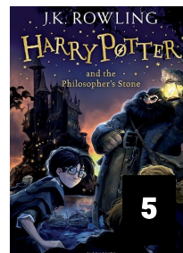
Harry Potter & the Philosopher's Stone JK Rowling