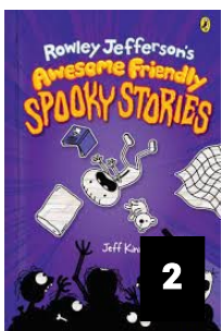
Rowley Jefferson's Awesome Friendly Spooky Stories Jeff Kinney

Andy and Terry live in the world's craziest treehouse. They like making books and telling jokes. And now they've made the world's funniest joke book. Again! From fairytale fun to classroom capers and movie madness, there are jokes galore for the whole family. An especially perfect book for fans of the Treehouse series. Q: What did one ghost say to the other ghost? A: Do you believe in people?